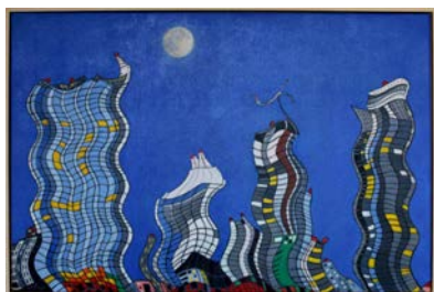
Twisted City by Bruce Berlow

Bruce Berlow's 3 paintings, Topsail Beach Afternoon , Twisted City , and Surf's Edge will be showing in the Voice Gallery's new show Summer Dance from June 1 through June 27.