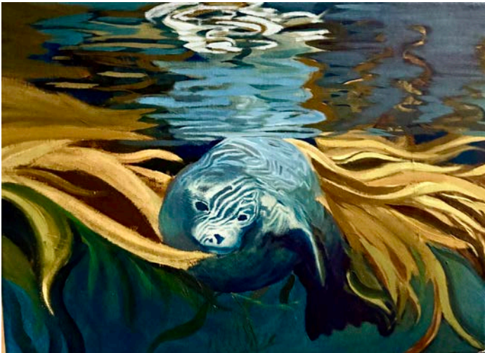
Sea Life by Odessa Burrow

“I’ve always felt a deep connection to the edge where land meets water — the coast, where beauty is both powerful and quiet. In this body of work, I explore the atmosphere, rhythms, and memory held in under the surface where sunlight filters through water, into these transitional spaces. Each painting is rooted in a moment of stillness: as sea life moves and is suspended in rich kelp beds.” - Odessa Burrow