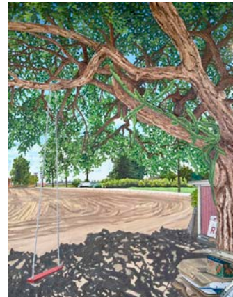
Camarillo Farmland by Matt Markum