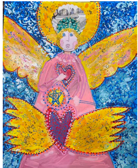
Angel by Mooneen Mourad

Mooneen Mourad is exhibiting 9 angel images in Sweetwater Cafe through October 2026, and florals in the Senator's office through September.