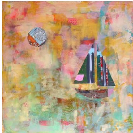
Peaceful Exploration by Deirdre Stietzel