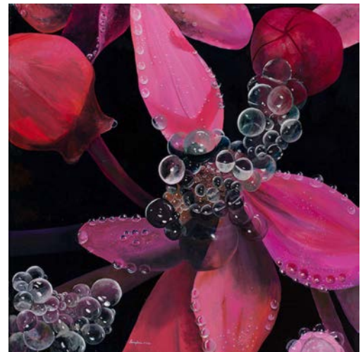
Magenta with Bubbles by séraphine

séraphine: Séraphine's 36" x 36" acrylic on canvas piece from her Fantastic Garden Water Drop Series has been selected for inclusion in ART FLUENT's online exhibition, based in Boston, MA. Out of 686 submissions from 14 countries, 72 works were chosen for this international public display. Created during the 1970s, Magenta with Bubbles is being exhibited publicly for the first time.