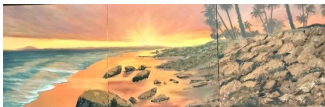
Echoes of the Tide by Odessa Burrow

Odessa Burrow's evocative triptych, Echoes of the Tide has been selected for inclusion in the Carpinteria Art Center's Classic Rincon Exhibit. It is a celebration of coastal landscapes and the timeless beauty of the Rincon shoreline. Odessa's work invites viewers to pause and reflect on the rhythmic dialogue between land and ocean, evoking both the power and tranquility of the coast. The exhibit opens Thursday, January 8th, and runs through Sunday, March 1st, 2026.