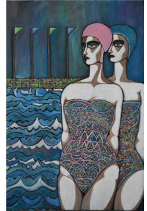
Swimmers by Nagui Achamallah

séraphine: Séraphine's 36" x 36" acrylic on canvas piece from her Fantastic Garden Water Drop Series has been selected for inclusion in ART FLUENT's online exhibition, based in Boston, MA. Out of 686 submissions from 14 countries, 72 works were chosen for this international public display. Created during the 1970s, Magenta with Bubbles is being exhibited publicly for the first time.