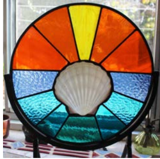
Bird's Eye View #3 by Paula Gregoire-Jones

Paula Gregoire-Jones had a multi-media mosaic piece, Bird's Eye View #3 and a stained-glass piece, "Ocean Sunset" juried into the Carpinteria Arts Center's Rincon Classic show running from January 8 to March 1, 2026.