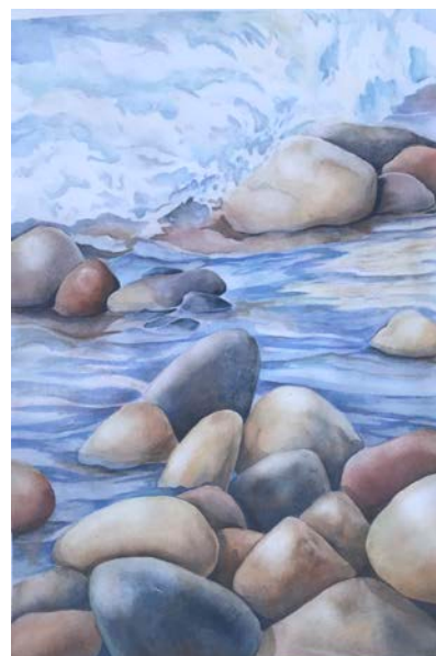
Charlotte Mullich's watercolor painting On the Rocks is on display at the Santa Clarita Art Gallery, in Old Town Newhall, CA from January 16- February 15.

For Sale Gilt picture Frame moulding. There are 12 sticks, each two inches wide, eight feet long, 96 feet of framing material. Price at $96.00 Contact Paul Longanbach at LPJ008@gmail.com