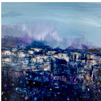
The Village by Merith Cosden

Merith Cosden sold her painting, The Village at the Carpinteria Arts Center last month. An acrylic abstract landscape from my imagination (influenced by travels past).