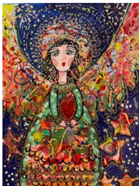
My Blue Heaven Angel By Mooneen Mourad