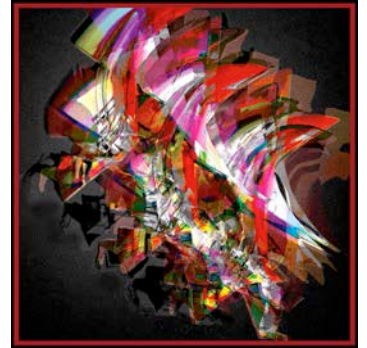
Descending by Fred Lehto

Séraphine had two acrylic paintings on 24"x 24" canvas accepted into the inaugural artist member exhibition at the Sasse Art Museum Pomona, CA. She continues to receive recognition for her water drop suite she refers to as My Fantastic Garden . This piece is inspired by her memories of childhood play areas in Louisiana, where she imagined winter swamp vines coming alive under moonlight, only to stand motionless at dawn until sunset revived them again. The painting was based on a cherished photograph Séraphine captured in the 1950s with a Brownie camera.