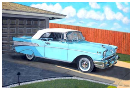
1957 Chevy Bel Air Convertible by Bruce Berlow

Bruce Berlow's oil paintings 1957 Chevy Bel Air Convertible and Sunrise Blues are showing at the Voice Gallery's Sunshine and the Blues Exhibit until December 27.