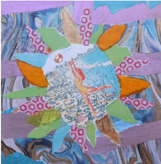
Catch Me At The Beach, Collage By Andie Adler

Frances Reighley will be showing at Sullivan Goss' 100 GRAND Exhibition, (100 works of art for $1,000 or less). The show will run from December 1 to December 28. Opening Reception: Thursday, December 4 th from 5:00pm-8:00pm. Sullivan Goss is located at 11 East Anapamu Street.