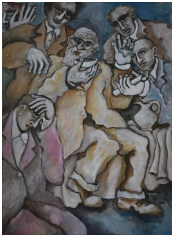
Death of Socrates by Nagui Achi

This 30x40-inch painting by Nagui Achi captures the poignant moment of Socrates' final act, as he prepares to drink the hemlock, steadfast in his refusal to compromise his principles. The delicate colors convey a serene yet somber atmosphere, while the figure of Socrates stands resolute, imparting his final lesson in ethics. even in the face of death, offering a timeless meditation on moral courage and philosophical integrity.