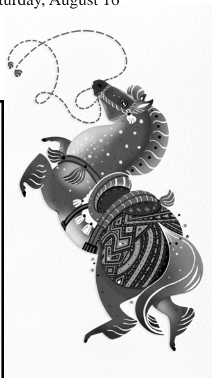
Horse with a Rope Bridle By Corinne Trujillo