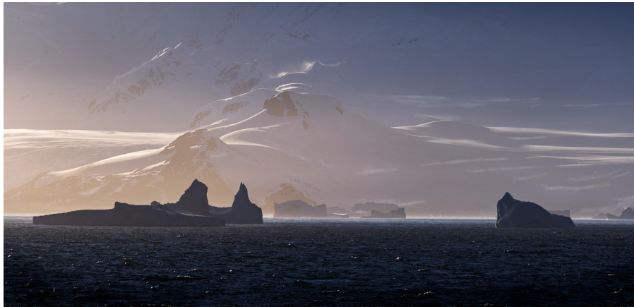
Floating Shadows by Sally Berry

Near & Far images created by Sally Berry deviates from the artist's west coast photo imagery to a land of ice and sea life - Antarctica. After arriving home and once again creating local images, Sally discovered a new found appreciation in the similarities and contrast of the local beauty with far away places reflecting on the fragility of both worlds.