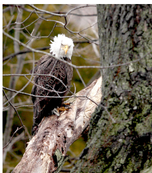
You Looking at Me? By Bruce Berlow

Bruce Berlow's oil painting You Looking At Me? is showing at the Voice Gallery's new show "Wild!" from March 31 to April 26.