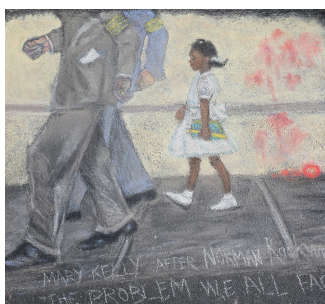
The Problem We All Live With