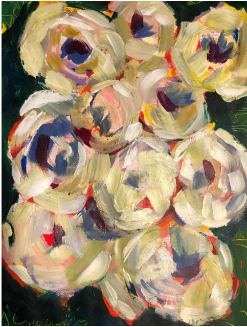
Roses in Winter by Mooneen Mourad