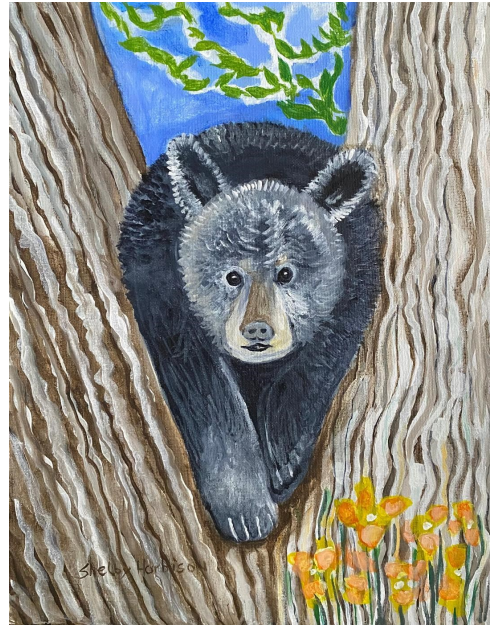
Bearly by Shelby Harbison