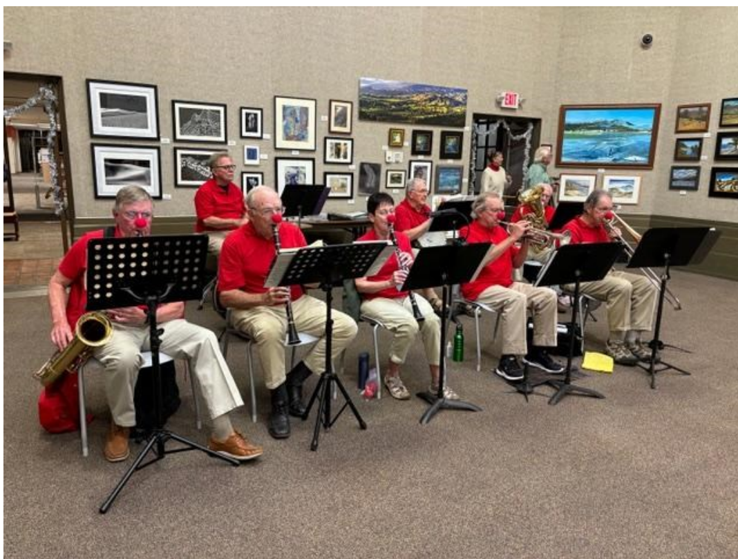
The Dixie Daddies at December's First Thursday reception at the Faulkner Gallery

Thank you all for your participation over the past year, and special thanks to those of you who've volunteered in 2023. We look forward to seeing you and your art in the coming year and wish you a new year filled with artistic inspiration.