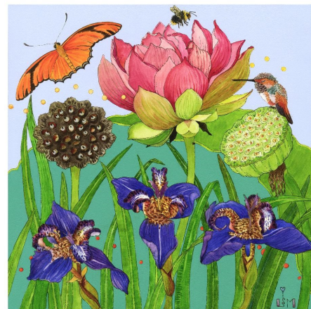
Lotus Iris Hummingbird by Lisa Skyheart Marshall

Lisa Skyheart Marshall's painting, Lotus Iris Hummingbird , is showing at the Beatrice Wood Center in Ojai as part of an Ojai Studio Artists group show titled Ojai Salon. The exhibit runs January 6 - March 2 , with opening reception January 6, 2-4 pm . The center is at 8585 Ojai Road, Ojai. Open Friday-Sunday, 11-5. More info at: beatricewood.com or SkyheartArt.com