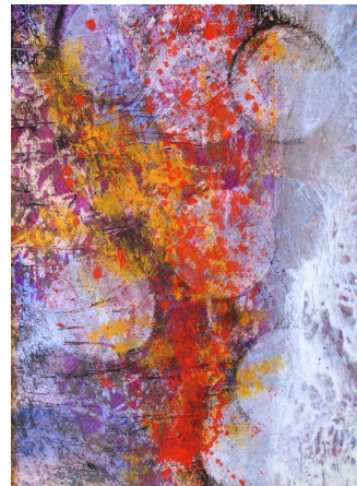
Pushing Back by Nancy Horwick

Nancy Horwick will be showing her abstract/mixed media work at Fox Fine Jewelry in Ventura. The show will run January 11 - April 7 . The reception is January 13, 5-7 pm . All are invited.