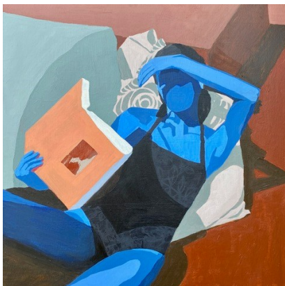
A Good Summer Read by Kellie Stoelting

Kellie Stoelting's pieces A Good Summer Read , Emerging , and Spring Impressions at Hale Park all sold last month!