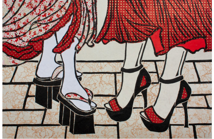
Slaves to Fashion 1a by Jerilynne Nibbe

Call to Artists: Bold Expressions 2023, Northern California Arts, Inc.(NCA) 68 th International Open Juried Art Exhibit. Open to fine artists everywhere. NCA, Inc., located in the Sacramento Area invites you to submit your original artwork. Photography, giclees, video, computer generated art, or crafts are not accepted for this show. Juror: Cheryl Gleason, https://www.gleasongallery.com/ Online application DEADLINE August 11, 2023 ; exhibit dates: October 3 - 28. Best of show $1,000 plus other awards. For detailed Artist's Prospectus: norcalartsinc.org & click on call to artists. Bold Expressions 2023. Info: paul@nccn.net 530-346-6078