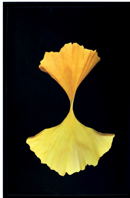
Fandango by Bruce Berlow

Bruce Berlow's large scale photograph Fandango is showing at the Voice Gallery's new show Earth Dance through April 30.