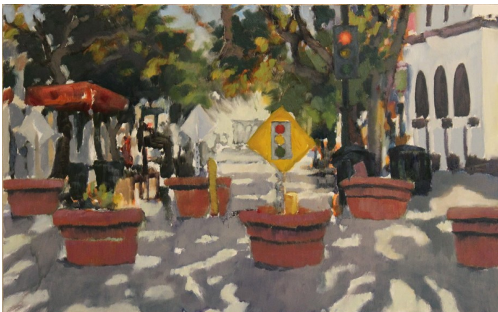
Cota and State