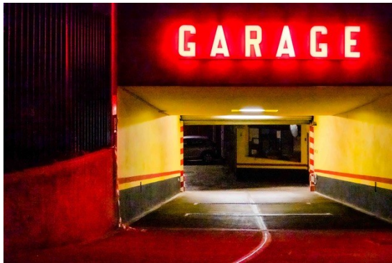
Milan Garage by Dan Gold

Dan Gold has had 3 photographs accepted into the exhibition The Get Aways at H Gallery, 1793 Main Street, Ventura. Boy In A Box , Parking Light , and Milan Garage are on display through April 15 .