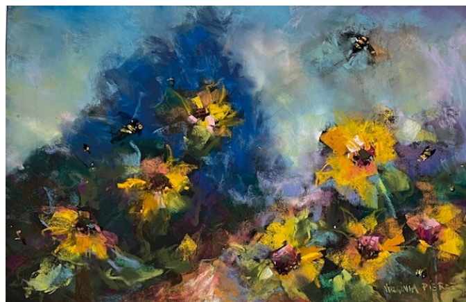
By Virginia Pierce