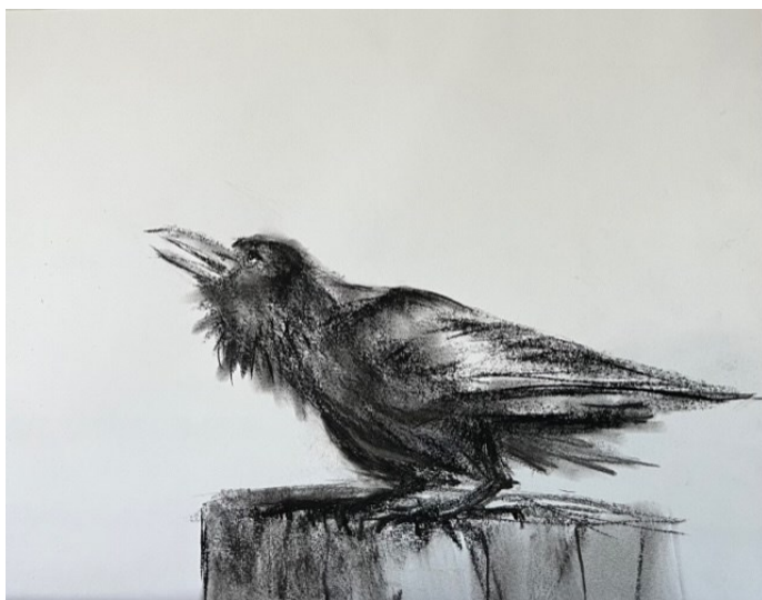
Rooftop Crow by Virginia Pierce