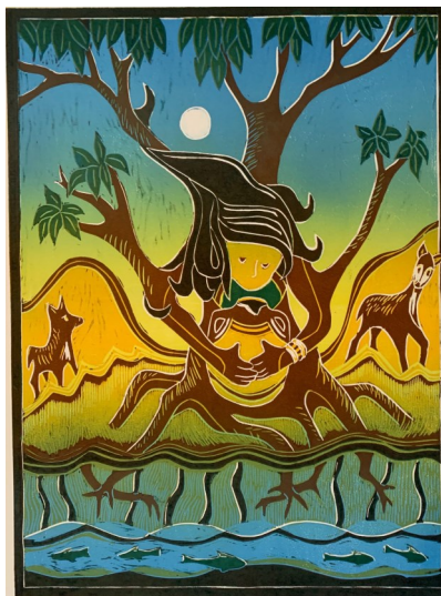
Balance by Karen Schroeder

Lori Call is included in an inaugural exhibit, Fitting Things Together, at Trinity Lutheran Church, with fellow collagists. The exhibit runs from late September through November 21 , at 909 La Cumbre (corner of La Cumbre and Foothill) M-F, 10-4.