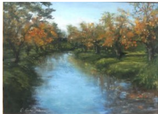
Honorable Mention: Japanese Garden by Diane Zusman