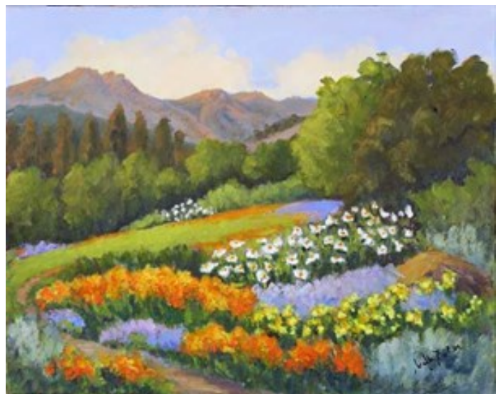
Botanical Gardens by Mirella Zunica Olson Submitted for postcard consideration