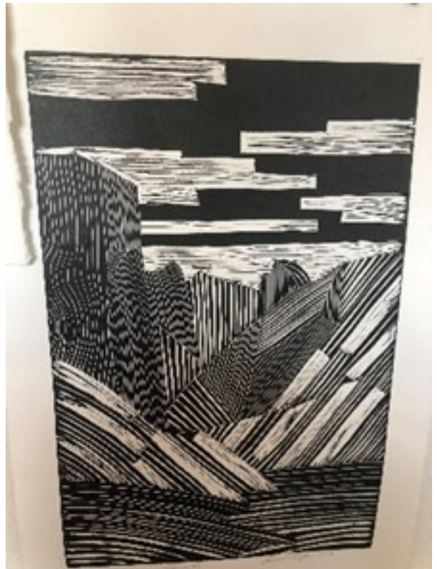
Yosemite by Ed Rodgers Submitted for postcard consideration