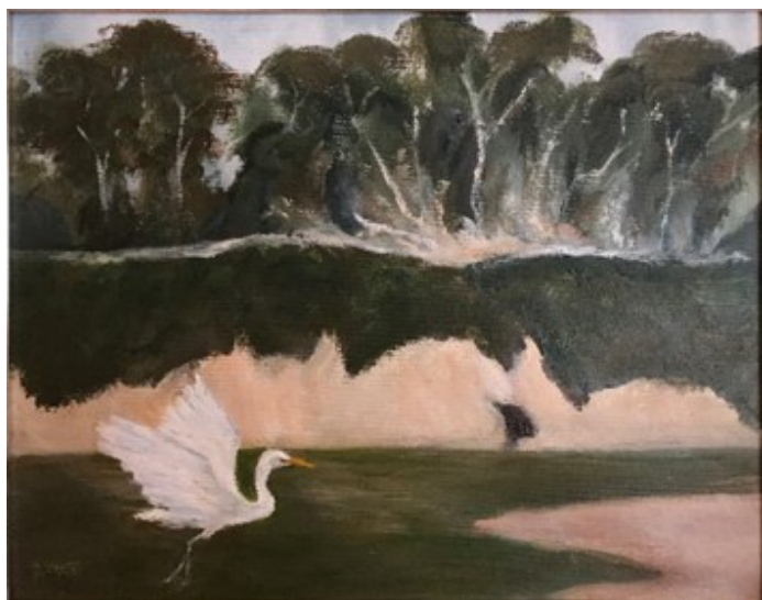
Taking Flight by Debbie Watts Submitted for postcard consideration

Make sure you read the 2020 Art & Photography Exhibitor Rules (pdf) available online.